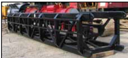
Standard 54" Offshore.