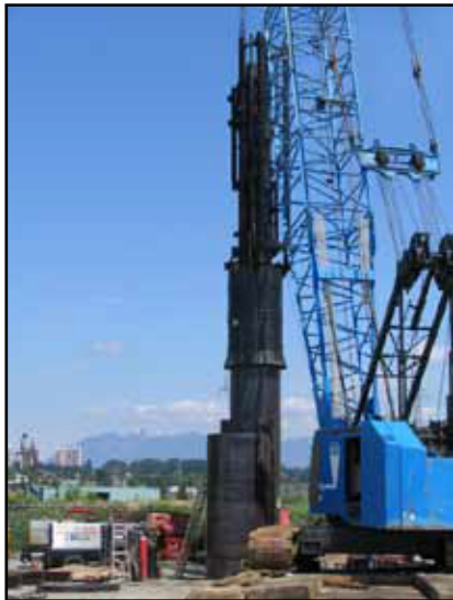
D160-42 driving 48" piles with a 54" offshore.