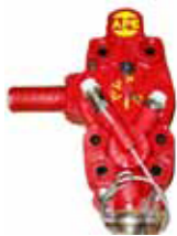
Optional Variable Throttle Control.