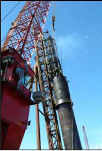
D225-42 With a 2.5 m Bottom Drive.