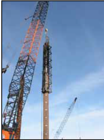
D138-42 in an offshore leader.